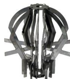
10 inch 26429