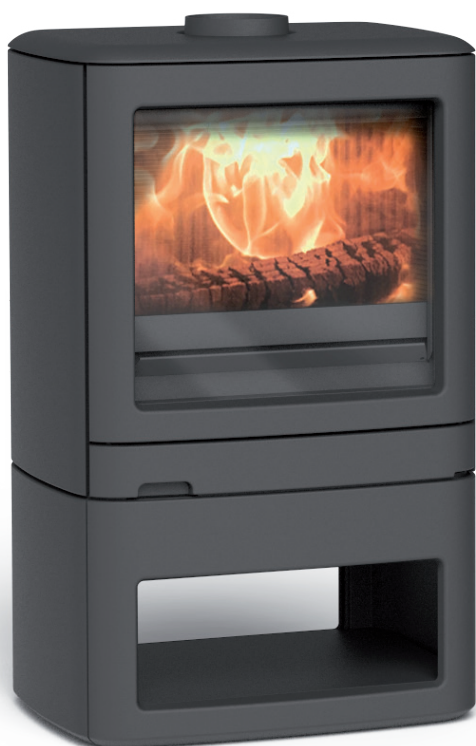
MQ33 With log-storage stand