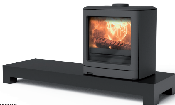
MQ33 With bench stand