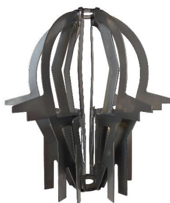
8 inch 26428