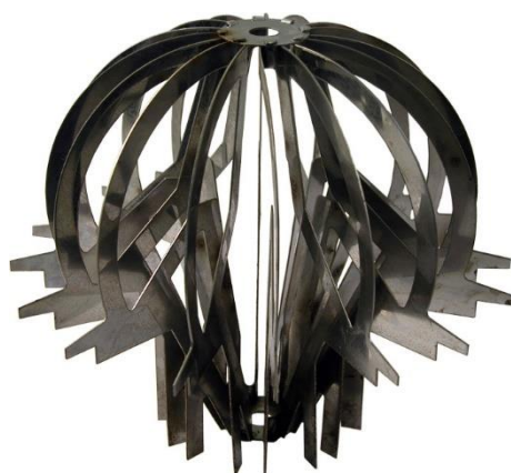
10 inch 26429

The 8-inch catalyser was redesigned in 2018 and the number of veins was reduced to stop carbon building up between them, which increases its life.